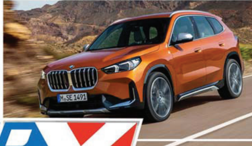
GREER, SC JUNE 23-25, 2023