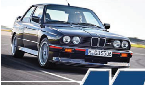
BMW CAR CLUB OF AMERICA

BIMMERLIFE'S ULTIMATE BMW ENTHUSIAST WEEKEND