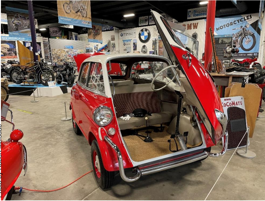
Isetta at the BMW CCA Foundation!