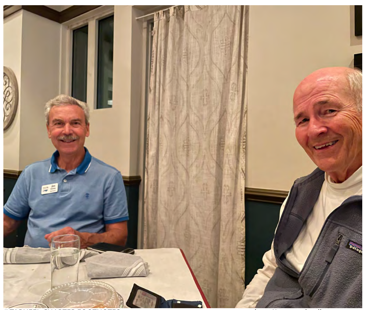
7 TARHEEL CHAPTER FOOTNOTES