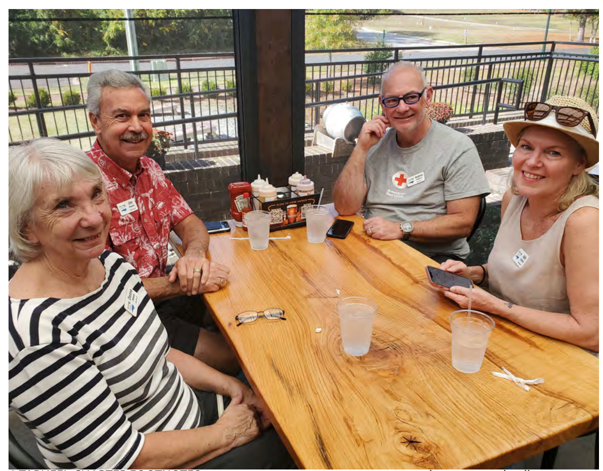
3 TARHEEL CHAPTER FOOTNOTES