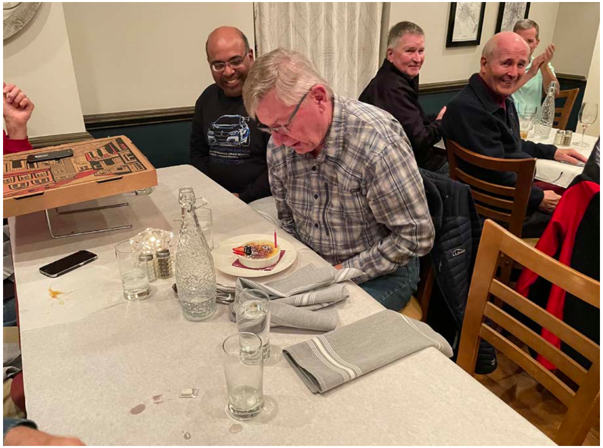
14 TARHEEL CHAPTER FOOTNOTES