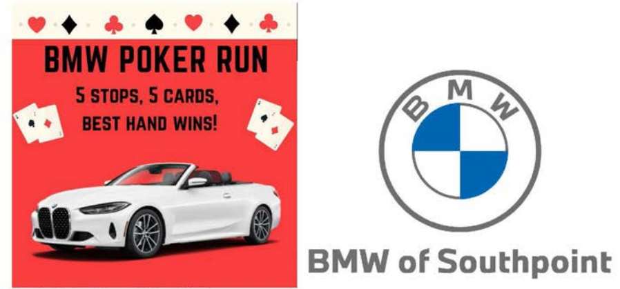
Deal Me In For a Poker Run!

Join us on Saturday, March 11<sup>th</sup> for our 2<sup>nd</sup> annual BMW of Southpoint Poker Run . We have planned a fun filled family spring event to drive through the scenic locations of this area. You'll have 5 stops to pick 5 poker cards and build your hand.