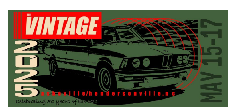
May 15-17, 2025 Vintage is being held at the Hendersonville airport.