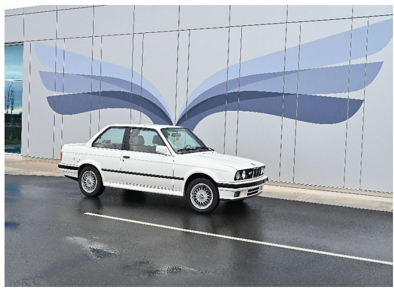
Another classic BMW lines up under the wings at the Sullenberger Aviation Museum