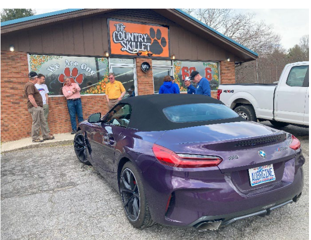
TARHEEL CHAPTER FOOTNOTES